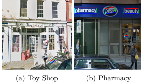
Fig. 3: Examples of incorrect classification results on the Storefront dataset. (a) GT: Toy Shop , Predicted: Bookstore - 0.58 (b) GT: Pharmacy , Predicted: Beauty Salon - 0.42

Fig.3 shows examples of incorrect prediction. As shown in Fig.3a, the scene-text detector failed to detect textual information on the corresponding image due to the uncommon font used in the signs. Therefore, the classification is only based on the visual features. This failure shows an obvious limitation of our method, i.e. that the overall performance is highly dependent on the performance of the scene-text detection module. Without textual information, the system simply relies on visual features. Fig.3b shows that the scene-text recognition module recognized two informative words ( pharmacy and beauty ) on the image, but the storefront type is not correctly classified. The reason of failure is likely to be that the semantic similarity scores of pharmacy and Beauty Salon are almost equal for this particular storefront. Therefore, similarly to the previous failure case, classification was only based on the morphological features of the storefront, which can indeed be erroneous.