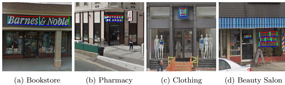
Fig. 2: Examples of correct classifications, with ground-truth label (GT) and probability score on the Storefront dataset. (a) GT: Bookstore , Predicted: Bookstore - 0.71; (b) GT: Pharmacy , Predicted: Pharmacy - 0.83; (c) GT: Clothing , Predicted: Clothing - 0.75, (d) GT: Beauty Salon , Predicted: Beauty Salon - 0.67

Discussion. In this section we discuss examples of scenes where ST-Sem provides non-obvious correct (Fig. 2) and incorrect (Fig. 3) predictions. As shown in Fig.2a and Fig.2c, ST-Sem can recognize the type of storefront, even when there is no word having direct relation to their types (e.g. book or clothes ); the proposed semantic matching module is able to infer that texts such as Barnes & Noble and GAP are, respectively, semantically close to bookstore and clothing in the vector space, thus enabling correct classification. As depicted in Fig.2b, the proposed method is also capable of measuring the semantic similarity between different languages. More specifically, Apotheke is recognized as a German scene-text on the image and then, it is transformed into a multilingual word vector which is semantically similar to Pharmacy .