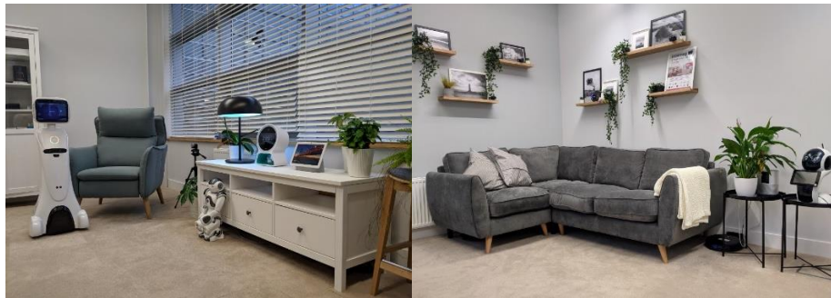
Fig. 1. Robot Home, University of Plymouth. From left to right, the robots in the picture are; AMY A1, NAO, and QBo One.

The Robot Home set up started in May 2019 and finished in September 2019. It was funded by the Interreg 2 Seas Mers Zeeën Ageing Independently (AGE'In) project. The aim of the lab design was to create a facility that follows strict care environmental guidelines for the evaluation of an HRI with seniors and vulnerable participants. A lab that will allow researchers to evaluate the acceptability and usability of AR technologies while supporting the integration of third party devices for the simulation of different scenarios related to smart homes and independent living. Figure 1 shows the lab that resembles a living room; a relatable, but a secure place that will reduce cognitive bias from experiment participants.