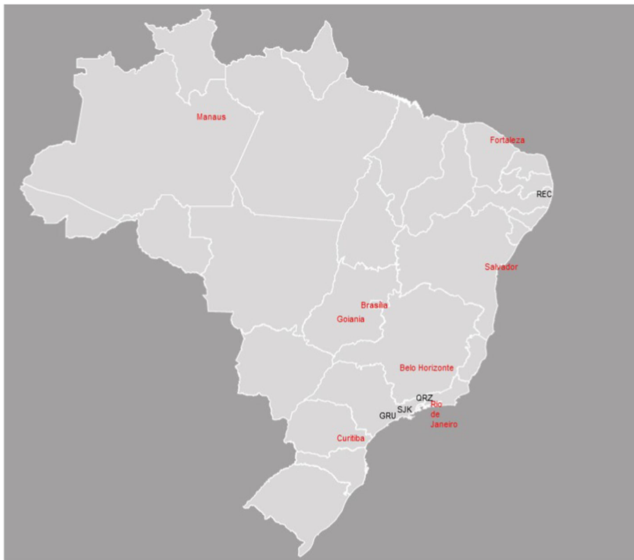
Fig. 3 Alternatives for industrial relocation