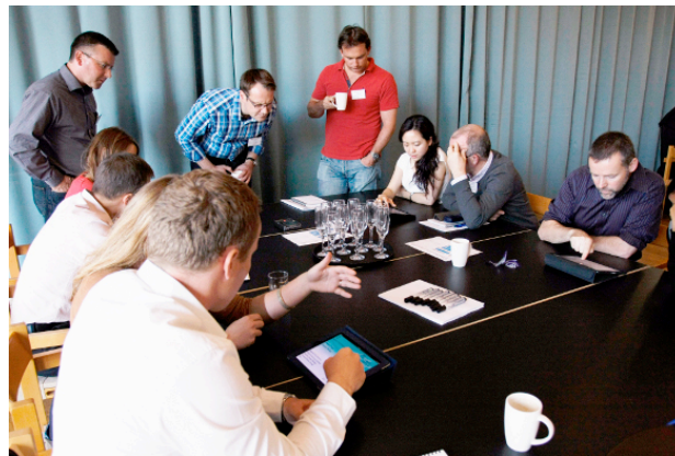
Figure 2: One of two teams/planets in 4Decades. With 4 tablets per team, decisions are initially discussed in pairs at the tablets. Focal attention is on the tablets, including spectators.

The 4Decades simulation [4] was designed to encourage managers from different cultural and professional backgrounds to negotiate climate spending. Comprising 8 tablets and 3 wall displays, it was trialed in four executive training workshops.